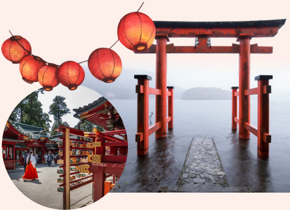
5 Hakone Shrine (Lake Ashi)

80-1 Motohakone, Hakone-machi, Ashigarashimo-gun, Kanagawa, Japan