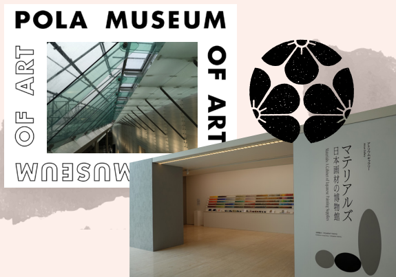
7 Pola Museum of Art

The field transforms into a silvery sea from late September to early November, when tall susuki grass sways in the wind across 180,000 square metres on Mount Hakone's slopes. Recognised among Kanagawa's top 50 scenic spots and 100 flower sites, the wide trail allows immersive walks amid golden autumn hues, offering Fuji views on clear days. Spring features controlled burns for regrowth, preserving this historic grassland once used for thatching roofs.