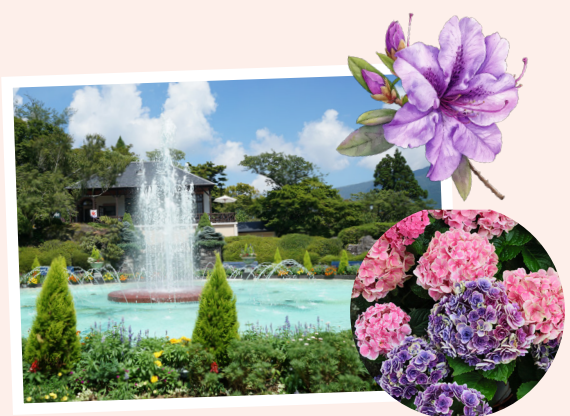
8 Gora Park

The museum opened in 2002 within Fuji-Hakone-Izu National Park, showcases over 9,500 works amassed by Pola cosmetics founder Tsuneshi Suzuki. Highlights include Impressionist masterpieces by Monet, Renoir, and Cézanne, plus Picasso, Van Gogh, and contemporary pieces in galleries blending seamlessly with surrounding forests via underground architecture and natural light.