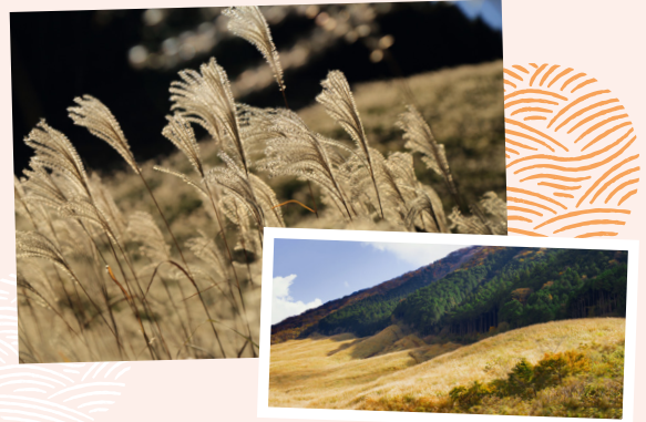
6 Sengokuhara Pampas Grass Field

Founded in 757 during the Nara Period, the shrine stands majestically on Lake Ashi's shores, enveloped by ancient cedars. Revered by warriors like Minamoto Yoritomo and Tokugawa Ieyasu for protection and victory, it honors deities for safe travels along the historic Tokaido Road. Iconic features include the vibrant red "Peace Gate" torii rising from the water and the Gongen-zukuri main hall.